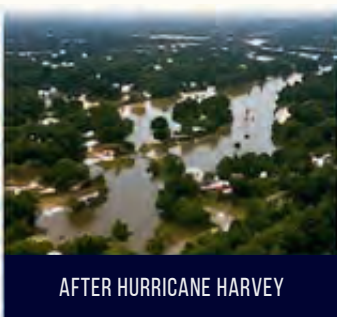
AFTER HURRICANE HARVEY