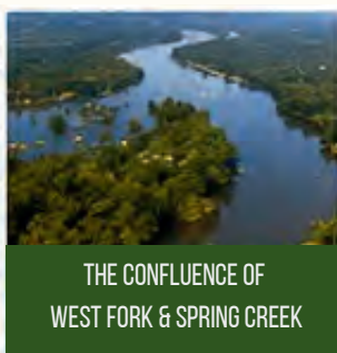
THE CONFLUENCE OF WEST FORK & SPRING CREEK

Our land. Our legacy. Our responsibility.