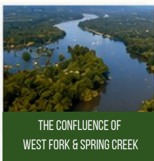
THE CONFLUENCE OF WEST FORK & SPRING CREEK

Our land. Our legacy. Our responsibility.