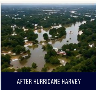
AFTER HURRICANE HARVEY