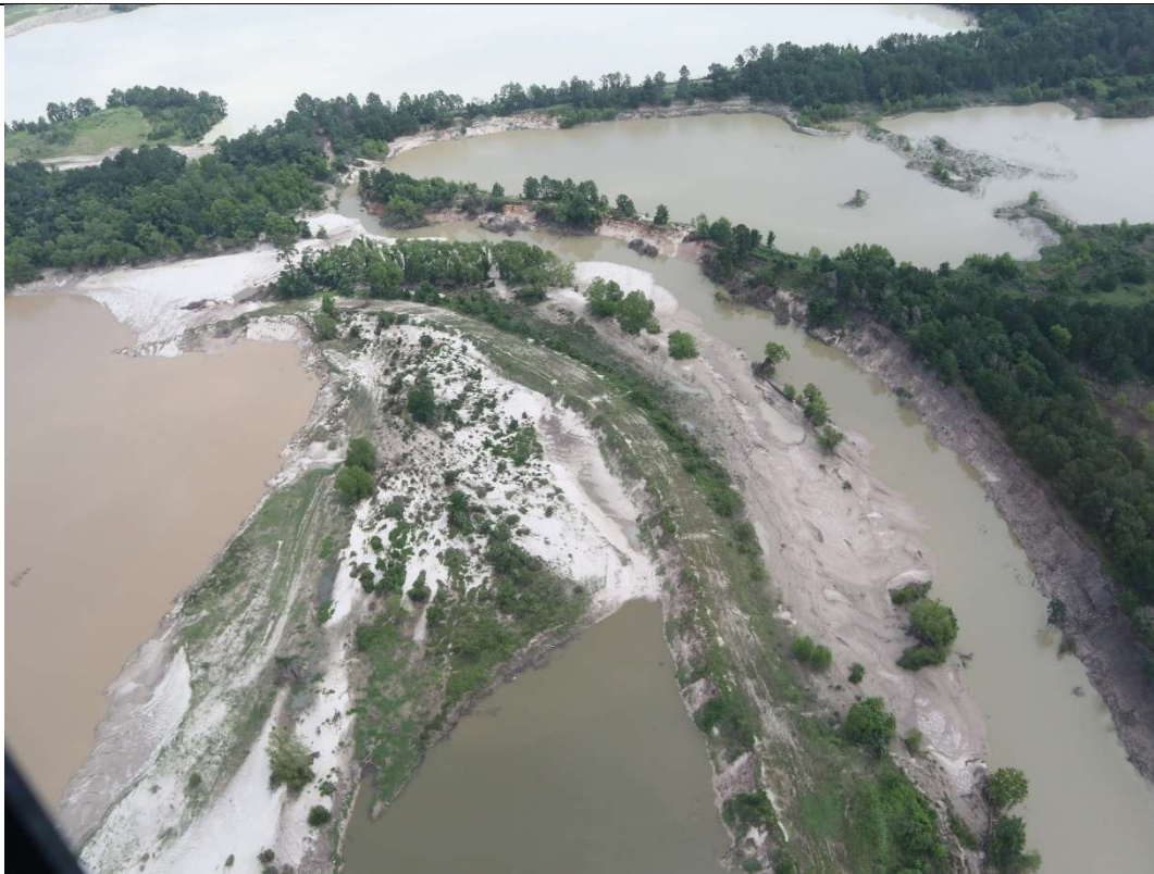
Photo No. 2: Sediment accumulations were noted at the West Fork San Jacinto River which appeared to have rerouted the river into the former APO dredging pit.