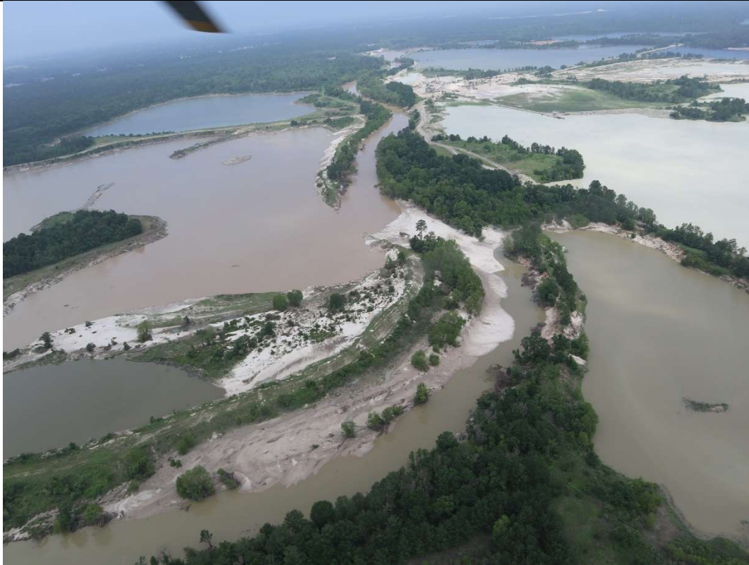
Photo No. 3: Sediment accumulations were noted at the West Fork San Jacinto River which appeared to have rerouted the river into the former APO dredging pit.