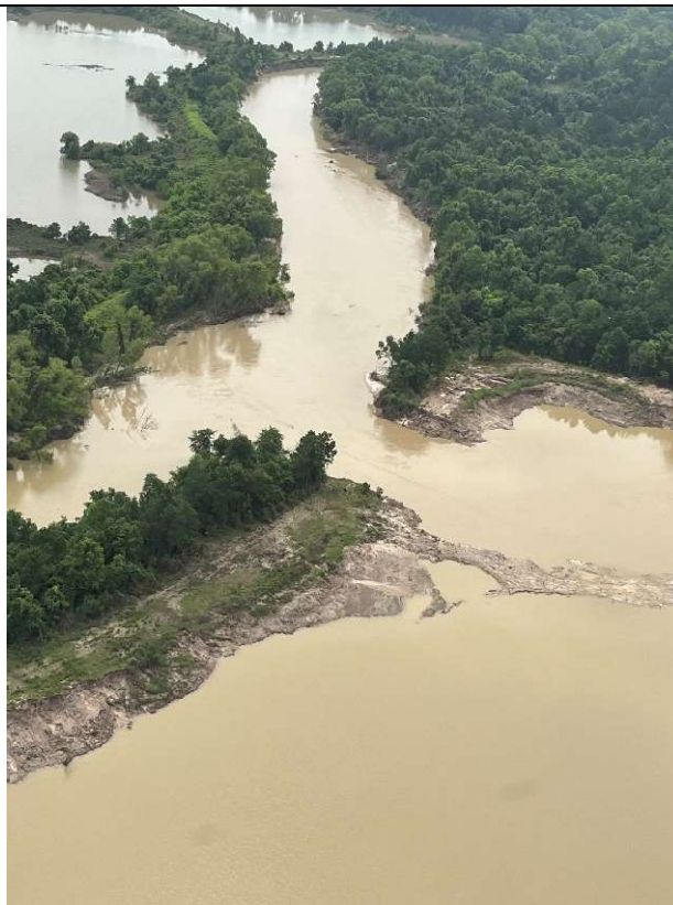
Photo No. 4: A portion of the berm at the southeastern part of the former APO dredging pit has eroded. The West Fork San Jacinto River flows out of the former APO dredging pit from this point. GPS Coordinates (30° 4'9.72"N, 95°16'58.32"W).