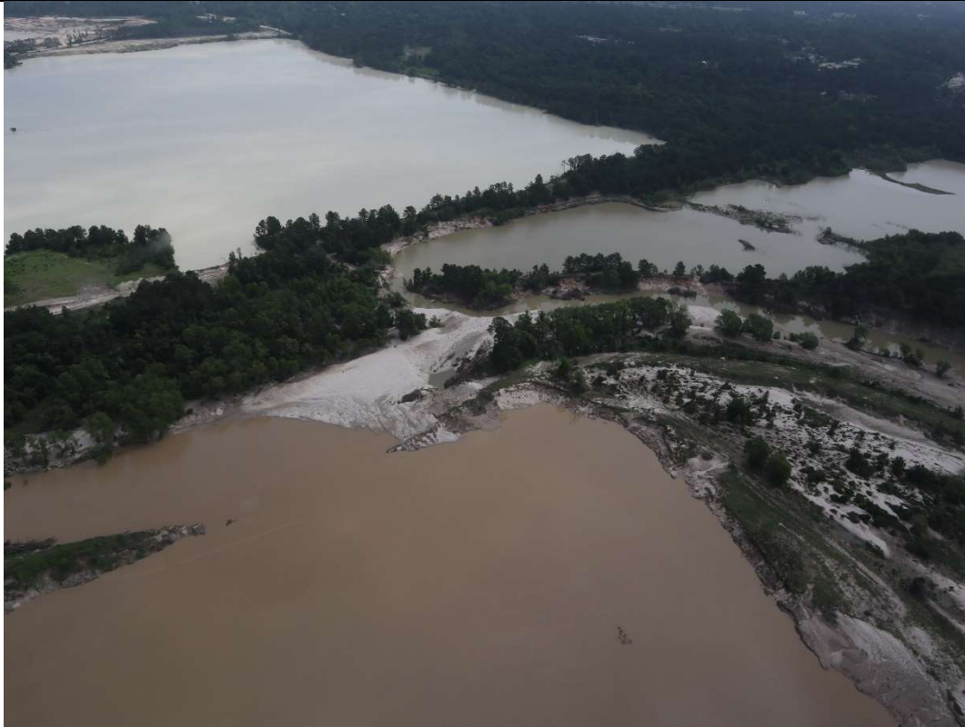
Photo No. 1: During the overflight conducted on May 28, 2024, it was noted that the West Fork San Jacinto River rerouted to the former APO dredging pit south of the Porter Plant site. GPS Coordinates (30° 4'39.29"N, 95°17'2.40"W).